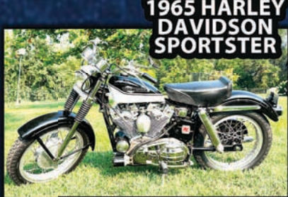
1965 HARLEY DAVIDSON SPORTSTER