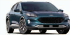
2020 FORD ESCAPE

$2,000 CASH BACK off MSRP* + 0% APR* | 60 MOS. FORD CREDIT FINANCING*