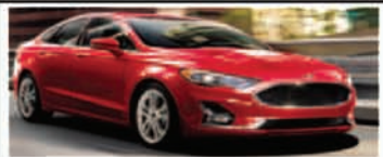
2020 FORD FUSION

0% APR* For 72 MOS. FORD CREDIT FINANCING*