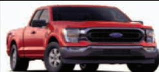
2021 FORD F-150

$1,500 CASH BACK off MSRP* + $500 Ford Credit Bonus Cash