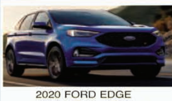
2020 FORD EDGE

0% APR* | 60 MOS. + $3,250 CASH BACK off MSRP* FORD CREDIT FINANCING*