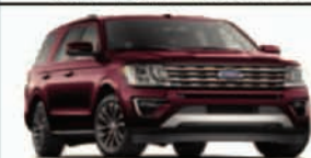
2021 FORD EXPEDITION

$2,750 CASH BACK off MSRP* + $1,500 Ford Credit Bonus Cash