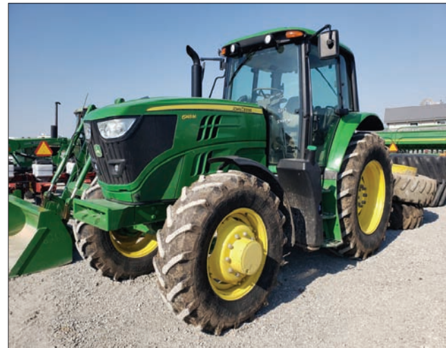
JOHN DEERE 6145 M TRACTOR: MFWD, 2485 Hours, New Rubber, 4 Door, Triple Hydr, 16 Speed, $69,500. Will Trade. Call (573)881-3557. B21

FOR SALE: 2016 Bass Tracker Pro 160 with 20 h.p. Mercury motor, less than 25 hrs. of use. Asking $7500 cash only. (573)528-0930.