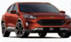
2021 FORD ESCAPE