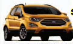
2021 FORD ECOSPORT